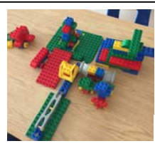
K Students Lego creations (above) /Creative Math concept art (right)

Kindergarten registration will commence on January 20, 2017 for the 2017-18 school year. Registration forms are available on YRDSB's website: www.yrdsb.ca . Children who turn four or five years old during 2017, live within the school boundary and whose parents are public school tax supporters will be eligible to register for kindergarten. A kindergarten information session for parents is being planned for this spring. For more information please visit the YRDSB website or contact your local school.